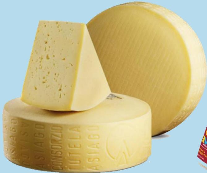
Asiago Fresh ¼ Wheel Aged 2 months Product Number: P-26 Pack/Weight: 4/7lbs Veneto, Italy