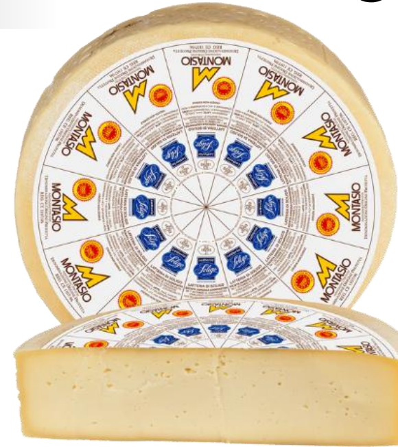
Montasio Mezzano Wheel Aged 6 Months. Product Number: P-25 Pack/Weight: 1/12lbs.