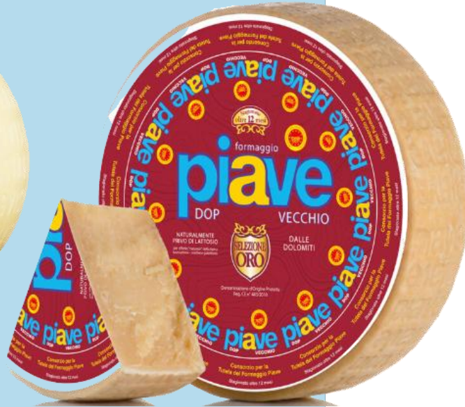
Piave Vecchio Wheel Aged 10/12 months. Product Number: P-24 Pack/Weight: 1/13lbs. Veneto, Italy