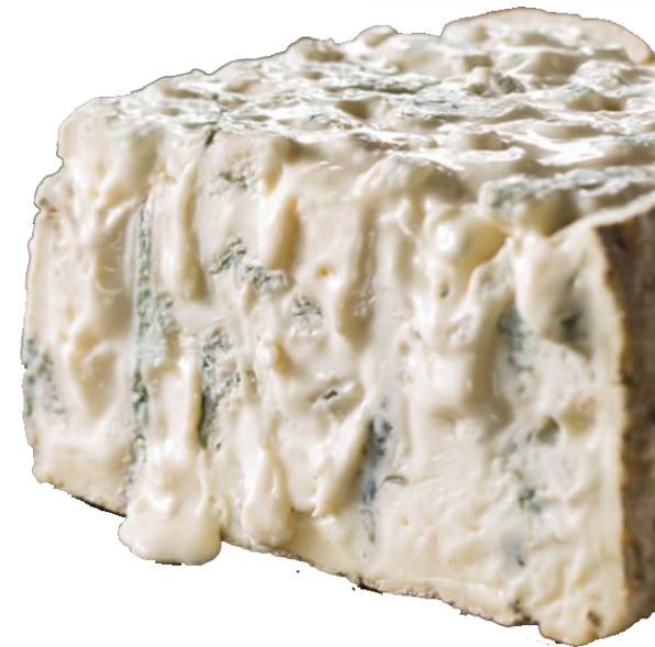
Gorgonzola Dolce Product Number: P-54 Pack/Weight: 4/3lbs